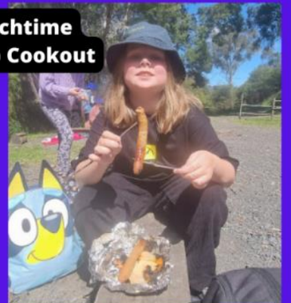
Lunchtime Camp Cookout