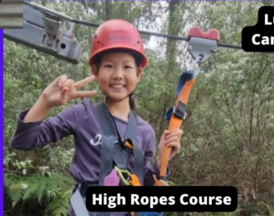
High Ropes Course