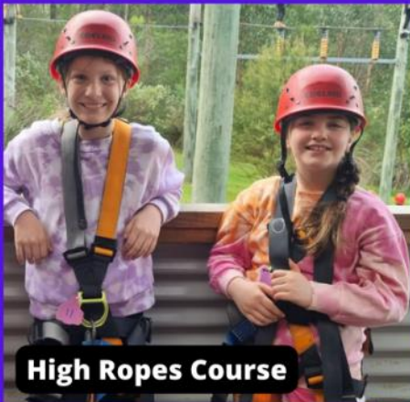
High Ropes Course