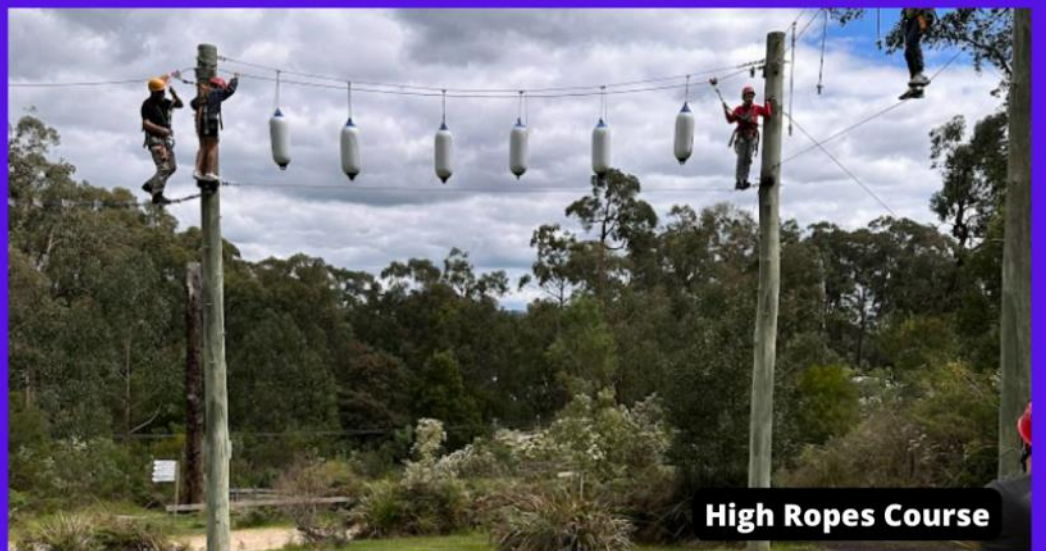
High Ropes Course